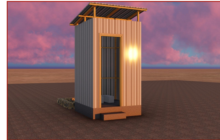
3D Render 1