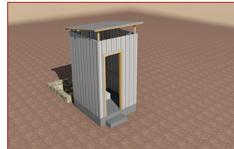
3D Render 2